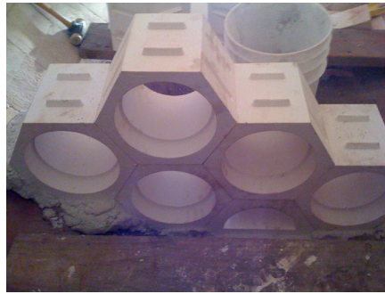
Blocks are locked together at installation