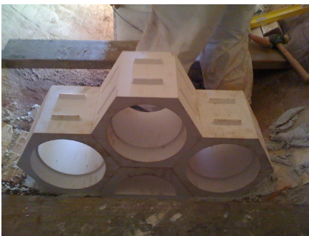
Hexagonal blocks are inherently stable