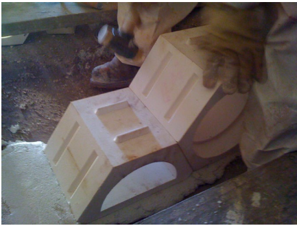
Alternating tabs and slots on each side