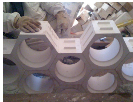
A fast, secure installation